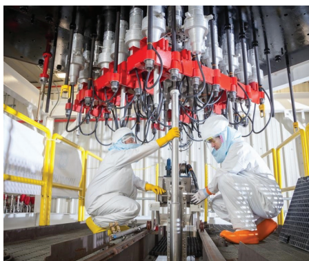
Nuclear professionals train in Wilmington, North Carolina