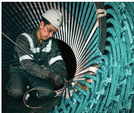
A generator specialist training at GE Vernova's Houston Learning Center