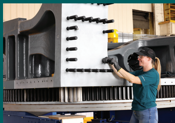
A technician installing hardware on a wind turbine bedplate in Schenectady, New York