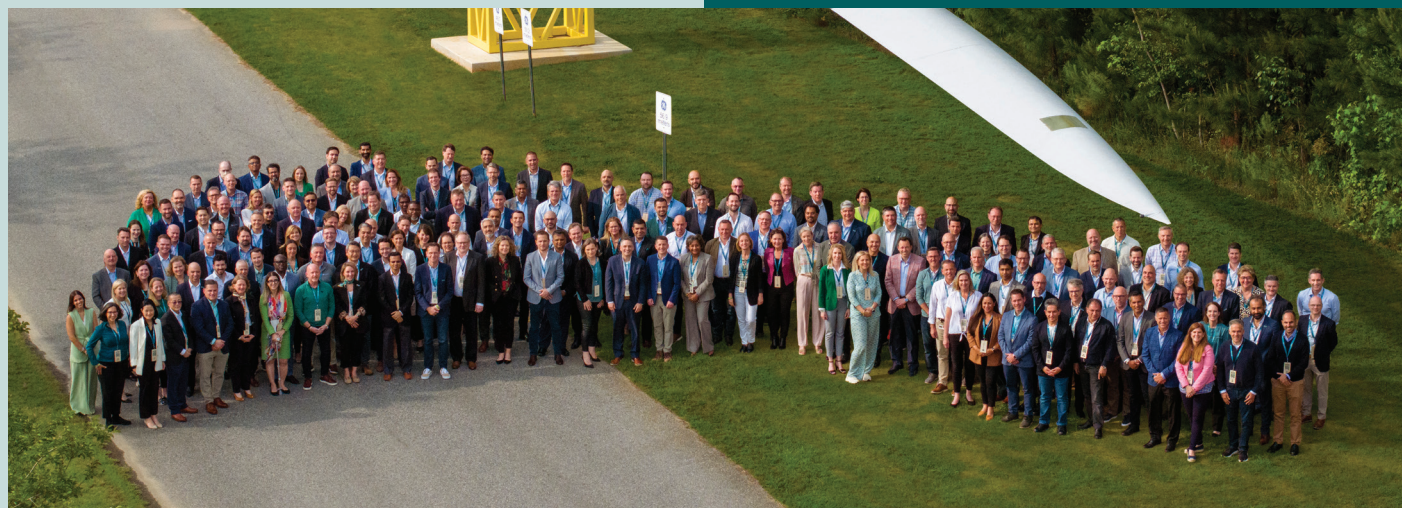
GE Vernova's leadership team at our Founders Meeting in Greenville, South Carolina