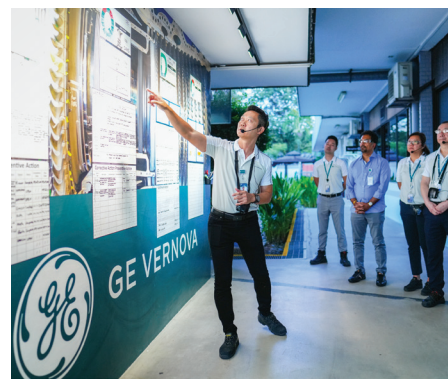
An employee discusses SQDC at the Gas Power Global Repairs and Services Center in Singapore

Offshore Wind experienced a tough year in 2024, but we will be better for it as we go into 2025. Today, we have wind turbines producing power in both the Atlantic and the North Sea. We are focused on executing on the existing backlog in the safest, highest-quality way and looking for smart opportunities to expedite completion of this backlog for our customers and our financials.