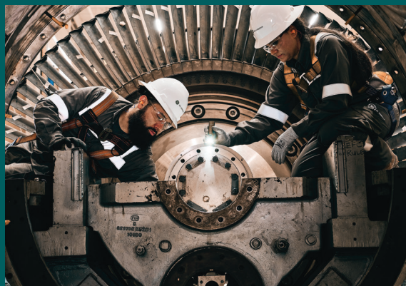
Expert craft professionals inspect a 7F gas turbine at GE Vernova's Houston Learning Center in Texas