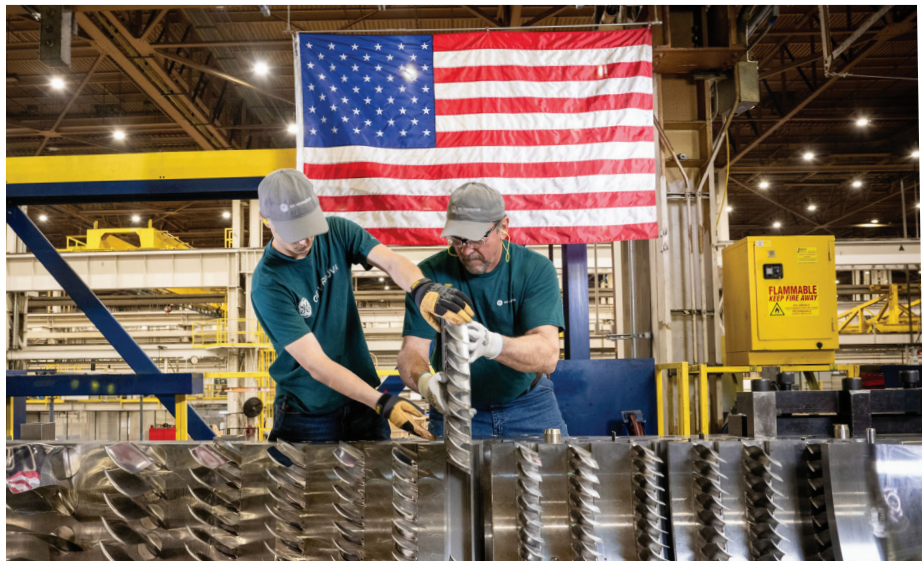
Technicians working on a gas turbine in Greenville, South Carolina

In parallel, we need serious, global industrialization of power generation technology which prioritizes scalable, "workhorse" power-dense products. These products need to be mass produced and be able to generate the maximum power density with minimal footprint. Grid equipment and energy storage systems are following a similar trend with enhanced standardized solutions to connect power generation sources, to transfer electricity at a higher scale to multiple points, and to be converted or stored to meet the increasing demands of load centers.