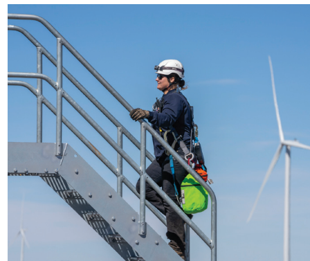
A technician performs maintenance on a GE Vernova onshore wind turbine in New Mexico