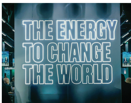
GE Vernova's purpose statement

With our unique scope, portfolio and scale, GE Vernova is well-positioned to lead the next era of energy.