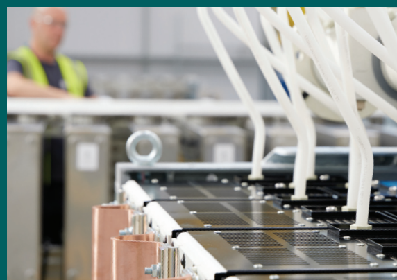
A technician working on Voltage-Sourced Converter valves in Stafford, United Kingdom