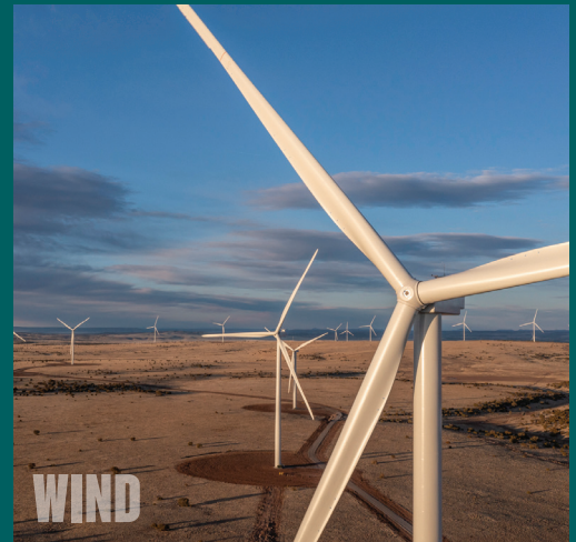
GE Vernova’s 3 MW onshore wind workhorse turbines in New Mexico, U.S.