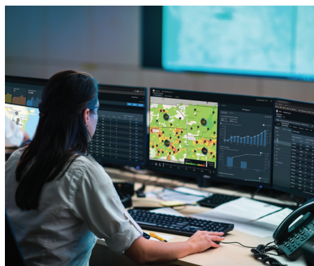
GE Vernova's GridOS® orchestration software