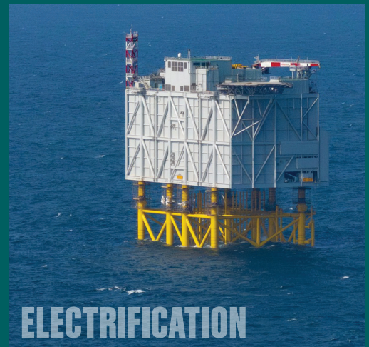
Installation of GE Vernova’s HVDC offshore converter platform for RWE’s Sofia Wind Farm in United Kingdom waters