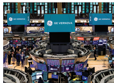
GE Vernova begins trading on the New York Stock Exchange under the ticker symbol "GEV"

At a segment level, in Power , we delivered solid growth and margin expansion led by strength in our Gas Power business. We anticipate this strength to continue into 2025 driven by multiple factors including demand from data centers associated with artificial intelligence, and we are investing to increase Gas Power capacity. Services, both a major business and source of cash flow for GE Vernova, also delivered a strong year with orders up ten percent organically as our customers invested into their existing plants.