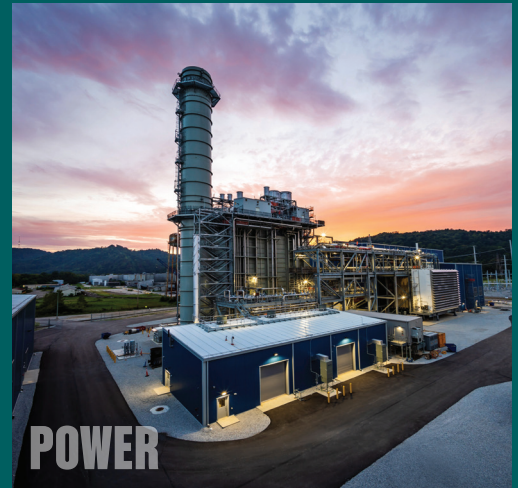
GE Vernova’s 7HA.02-powered Long Ridge Energy Terminal in Ohio, the first hydrogen-burning power plant in the U.S.

We sometimes use information derived from consolidated financial data but not presented in our financial statements prepared in accordance with U.S. generally accepted accounting principles (GAAP). Certain of these data are considered “non-GAAP financial measures” under the U.S. Securities and Exchange Commission rules. These non-GAAP financial measures supplement our GAAP disclosures and should not be considered an alternative to the GAAP measure. The reasons we use these non-GAAP financial measures and the reconciliations to their most directly comparable GAAP financial measures can be found in the Management’s Discussion and Analysis section within our Form 10-K and in GE Vernova’s fourth quarter 2024 earnings materials posted to governova.com/investors , as applicable.