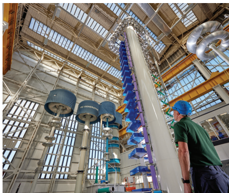
High voltage test lab at the power transformer factory in Stafford, United Kingdom